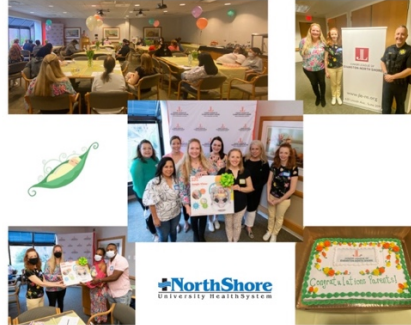
Baby Steps Shower at NorthShore University HealthSystem Evanston Hospital, April 15, 2023