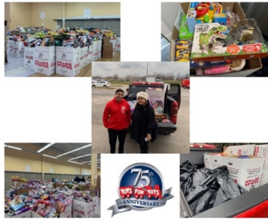
Toys for Tots collection drive, November-December 2022