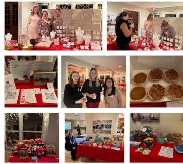
November General Membership Meeting & Holiday Marketplace, November 16, 2022