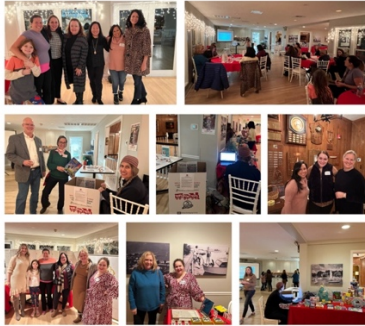
November General Membership Meeting & Holiday Marketplace, November 16, 2022